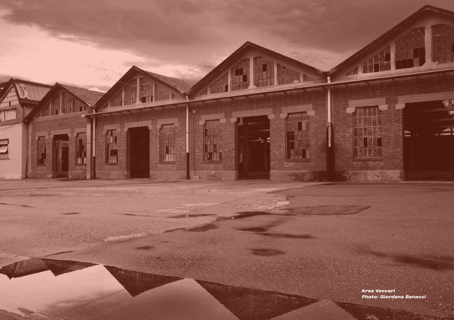
Area Vaccari