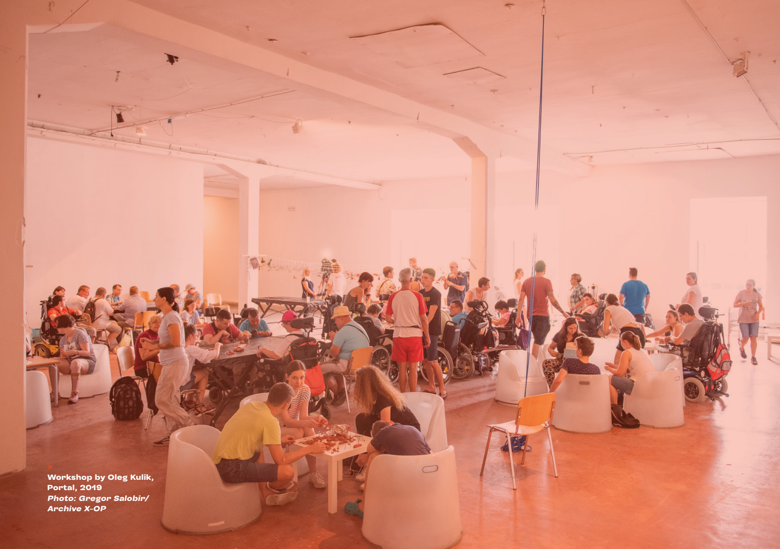
Workshop by Oleg Kulik, Portal, 2019