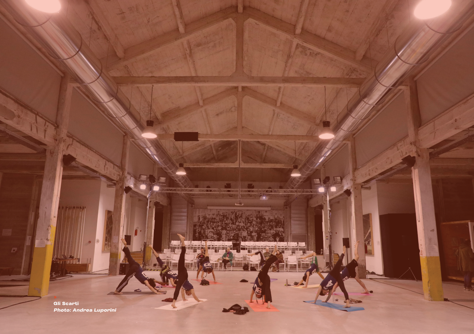
Gli Scarti